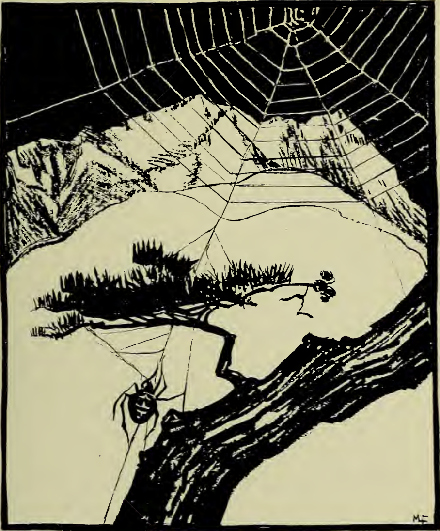
HE SAID FAREWELL TO THE SKY COUNTRY AND LET HIMSELF DOWN TO EARTH—BY ONE OF HIS OWN STRANDS OF YARN